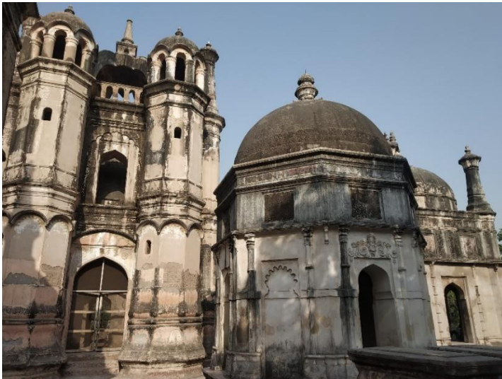
Old English Cemetery Surat, Gujarat