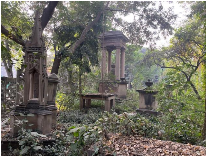
Old Civil Cemetery on Maqbool Alam Road, Benares