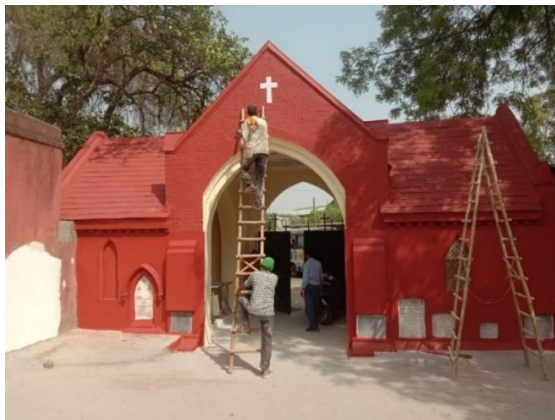
Gateway of the Nicholson (Kashmir Gate) Cemetery, Delhi