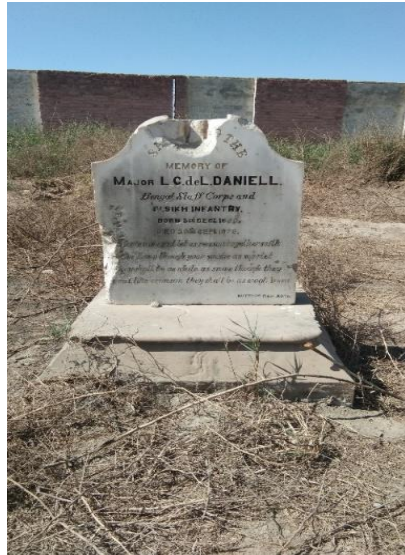
Dera Ismail Khan cemetery, Pakistan