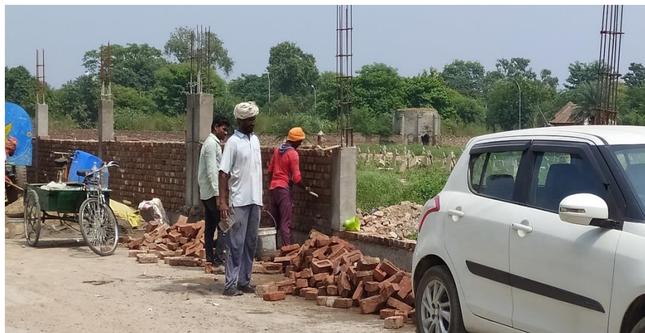
Cantonment Cemetery, Ambala