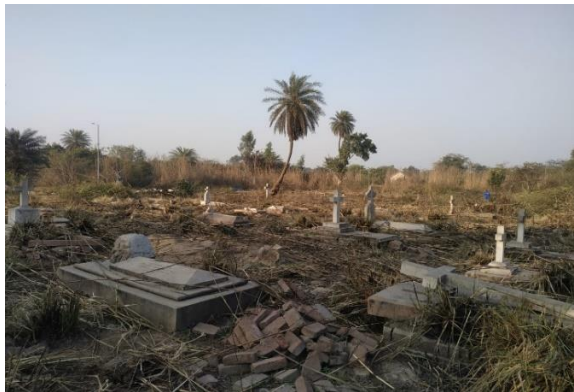
Ambala Cantonment Cemetery, India.