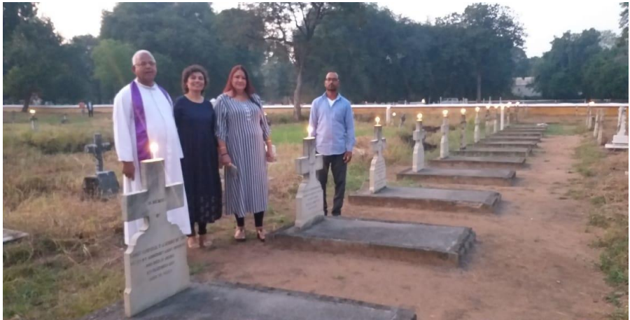
Jhansi Cantonment Cemetery, Jhansi. All Souls' Day 2021.