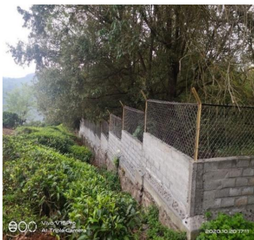
Tiger Hill Cemetery, Coonoor, Nilgiris.

The Financial Statements for the year to 31 December 2021 are to be found elsewhere in this report.