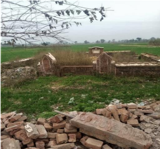
Grave of men of the 24 th (2 nd Warwickshire) Regiment of Foot, Chillianwala, Pakistan

PROJECTS SUBCOMITTEE The subcommittee completed its work on a format for assessing the heritage significance of cemeteries and this is now available on the website for anyone who knows a cemetery well to complete. Contributions from members would be most welcome.