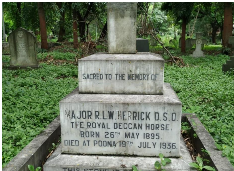
St Sepulchre's Cemetery, Poona