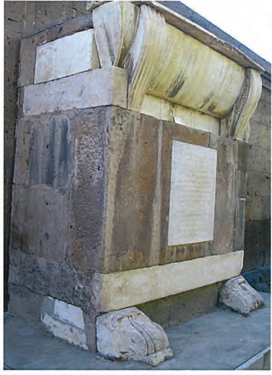
below: the newly restored Garrison Cemetery at Seringapatam (see page 8)