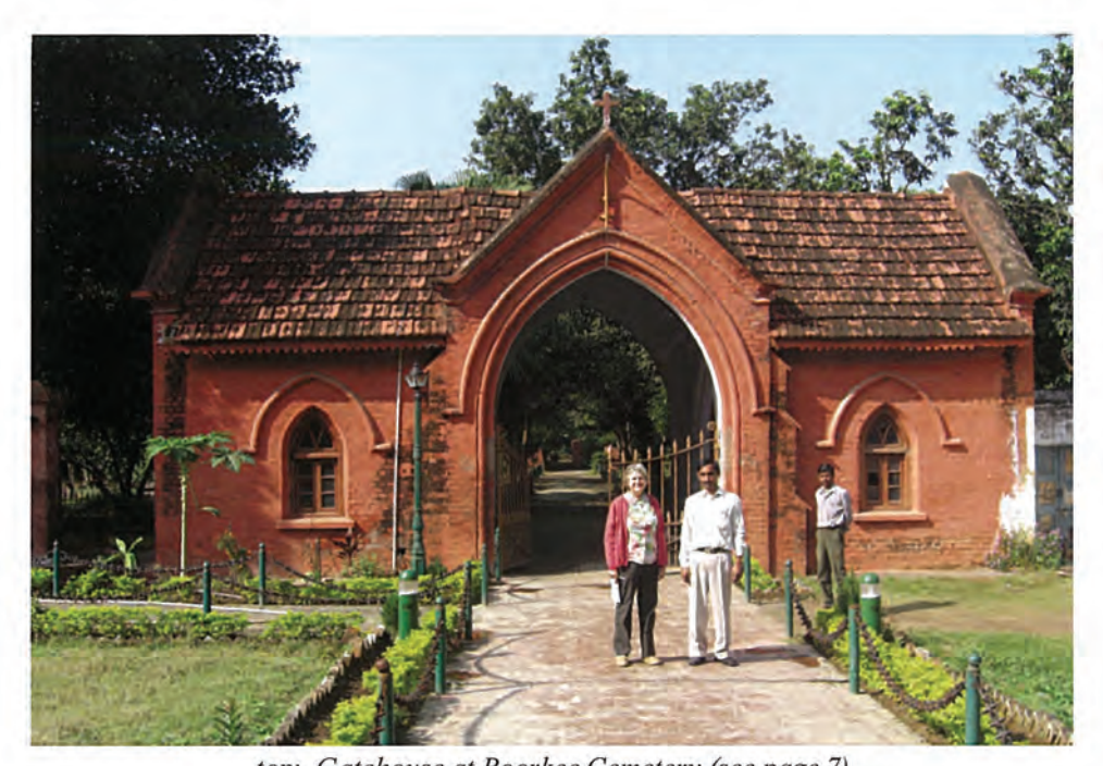
top: Gatehouse at Roorkee Cemetery (see page 7) lower: placing flowers on a hidden grave in Agra cemetery (see page 6)