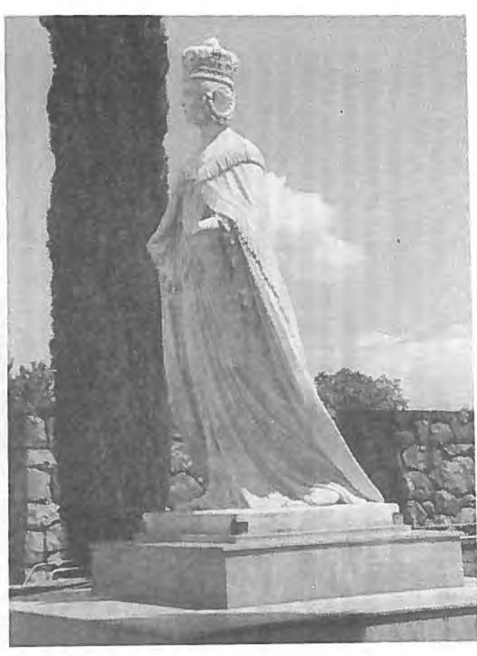
The newly restored statue of Queen Victoria at the British High Commission, Islamabad (see p22)