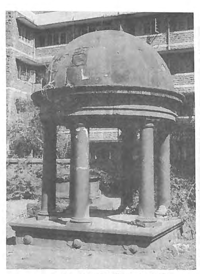
The 18th century French tomb at Poona (see p30)